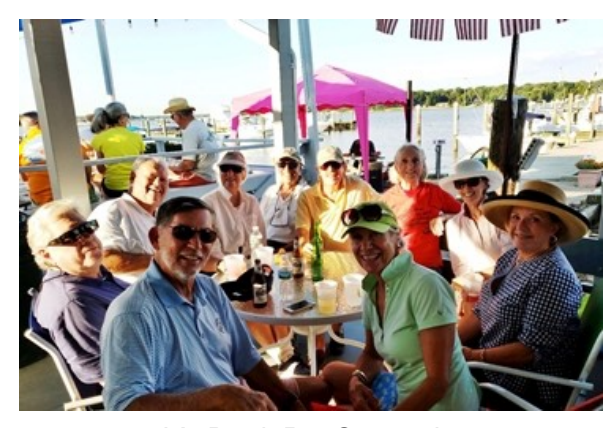
It's Dock Bar Season!

As I mentioned last month, our review of our budget and forecast presents the Finance