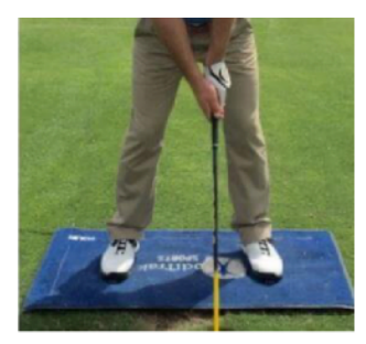
BodiTrak Pressure Mat

If you think any of this is complicated, trust me it's not. The combination of using Video , FlightScope , and BodiTrak speeds up the process of correcting swing flaws. Let's keep your season going by meeting me in the Golf Studio! Contact me at dphilippon@crycc.org or call the Golf Shop at 401-778-3818 x3.